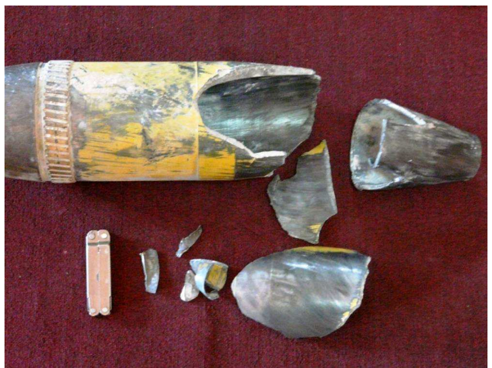
An artillery carrier shell which ejects a canister for illumination

Amnesty International delegates encountered 155mm M485 A2 illuminating shells used by the IDF which had landed in built up residential areas in Gaza. These eject a phosphorus canister, which floats down under a parachute. At least three of these carrier shells were found which had landed in people's homes. These shells are yellow and one had the following markings: TZ 1-81 155-M 485 A2. TZ is a known marking on Israeli ammunition.