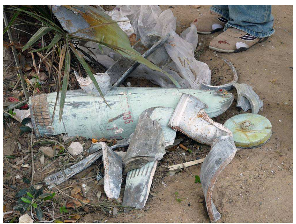
A white phosphorus carrier shell

Amnesty International found that the Israeli army used white phosphorus, a weapon with a highly incendiary effect, in densely-populated civilian residential areas in and around Gaza City, and in the north and south of the Gaza Strip. The organization's delegates found white phosphorus still burning in residential areas throughout Gaza days after the ceasefire came into effect on 18 January - that is, up to three weeks after the white phosphorus artillery shells had been fired by Israeli forces. Amnesty International considers that the repeated use of white phosphorus in this way in densely-populated civilian areas constitutes a form of indiscriminate attack, and amounts to a war crime.<sup>3</sup>