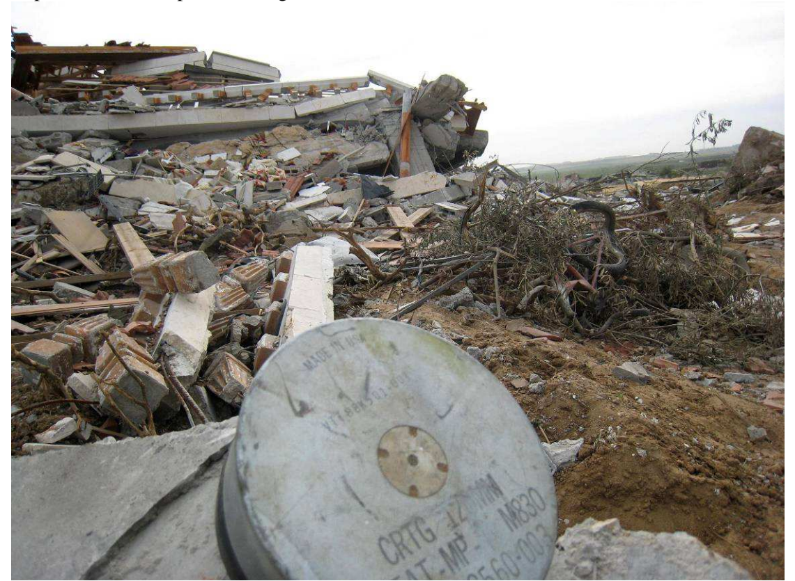
Base of tank cartridge found by Abu Abdullah Abu 'Ida outside his house

The markings on the base of one tank round found by Amnesty International delegates in Gaza at the destroyed house of the Abu 'Ida family indicated that it was a 120mm M830 High Explosive Multi Purpose Cartridge made in the USA.